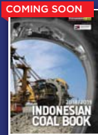
Indonesian Coal Book 2018/2019 Price: US$200