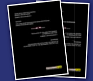
Various Indonesian laws, Government Regulations, Ministerial Regulations/Decrees on INDONESIAN COAL & MINERALS MINING, OIL & GAS, ELECTRICITY, FORESTRY, & ENVIRONMENTAL