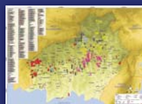
Provincial Minerals Maps Size: 1189 x 841 mm (A0); Laminated Release: Juni 2015; Price :US$400 Acheh • North Sumatra • WestSumatra • Riau • Riau Islands • Jambi • Bengkulu • all Provinces throughout Indonesia.