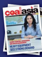
COAL ASIA Monthly Magazine (issued 15 th of each month) Price: US$9.00