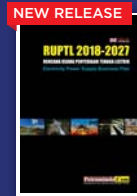
RUPTL 2018-2027 Electricity Power Supply Business Plan English Version Price: US$385 Indonesia Version Price: US$195