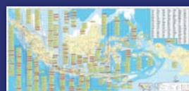
Indonesian Hydro Power Map 2017 Size: 1812 x 841 mm (A0+); Laminated Release: January 2017; Price :US$150