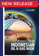
Indonesian OIL & GAS Book 2018 Price: US$200 Release: May 2018