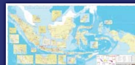
Indonesian Electricity Map 2017 Size: 1811 x 841 mm (A0+); Laminated Release: August 2017; Price: US$300