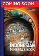
Indonesian Minerals Book 2018/2019 Price: US$200