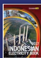
Indonesian Electricity Book 2017 Price: US$250 Release: April 2017