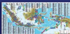
Indonesian Conventional Oil & Gas Map Size: 1812 x 841 mm (A0+); Laminated Release: August 2017; Price :US$300