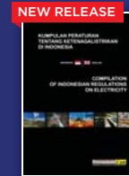
Compilation of Indonesian Regulations on Electricity Indonesia – English (Book 5) Price: US$310