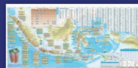
Indonesian Geothermal Map Size: 1812 x 841 mm (A0+); Laminated Release: Sept 2016; Price :US$200