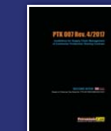
PTK007 Rev.4/2017 (I) Guidelines for Supply Chain Management of Contractor Production Sharing Contract (English/Indonesia /Bilingual version) Release: July 2017 Price: US$193